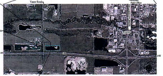
Kea West WMA AERIAL PHOTO SCALE: 1" = 1000'